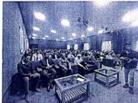
Guest Lecture on EDP

Approved Principal Dolphin (PG) Institute of Bio-Medical & Natural Sciences, Manduwala, Dehradun