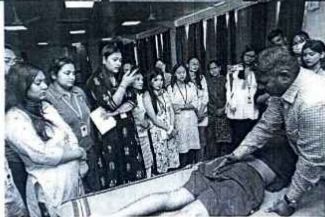
MYOFASCIAL RELEASE EDP ON 19-20 TH APRIL, 2022