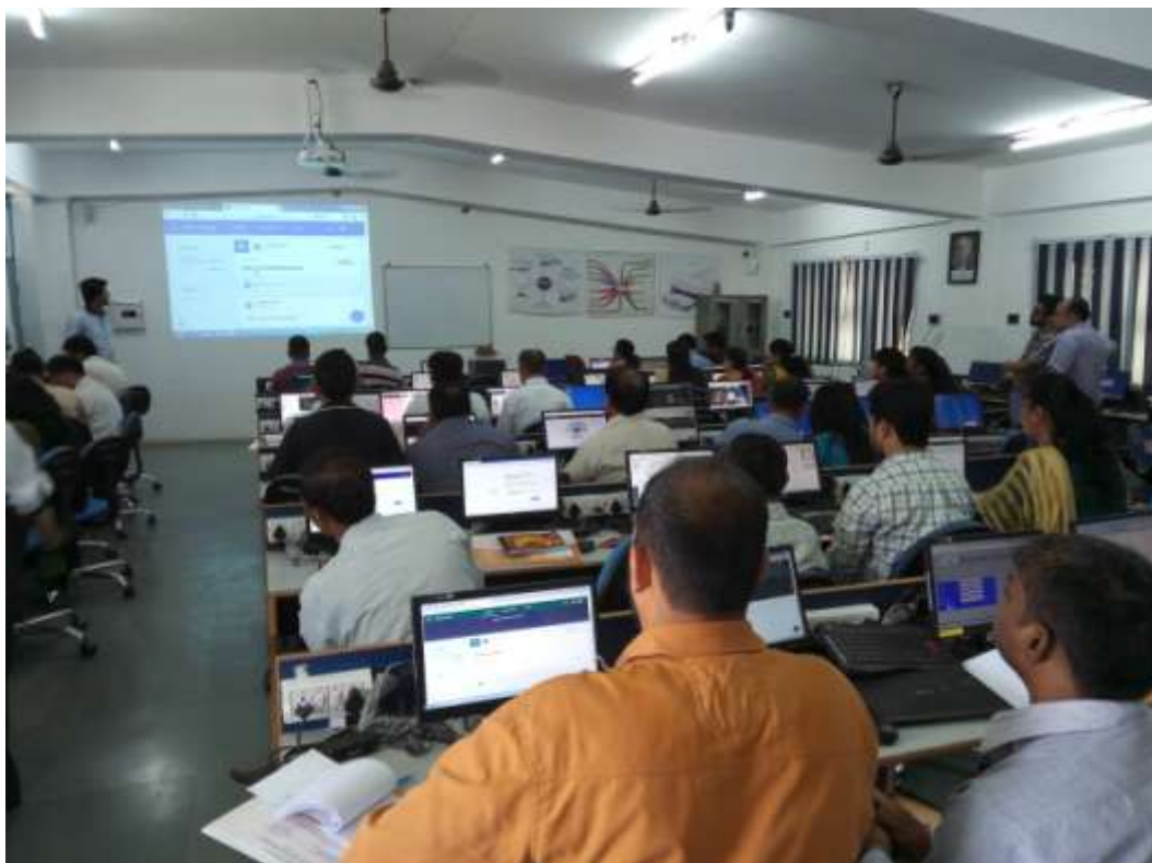
H-o-T during FDP on use of “ICT in Education and research methodology...”.